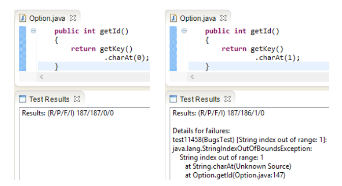
Figure 8: Continuous testing running on Apache commons.cli. The left screenshot shows the original commons.cli implementation, for which all tests pass. The developer defines the id of an option to be its second character (right screenshot) and immediately sees that this change causes an existing test to fail.

mented using project builders. Solstice and its API provides a richer, alternative way to integrate third party analyses into the IDE.