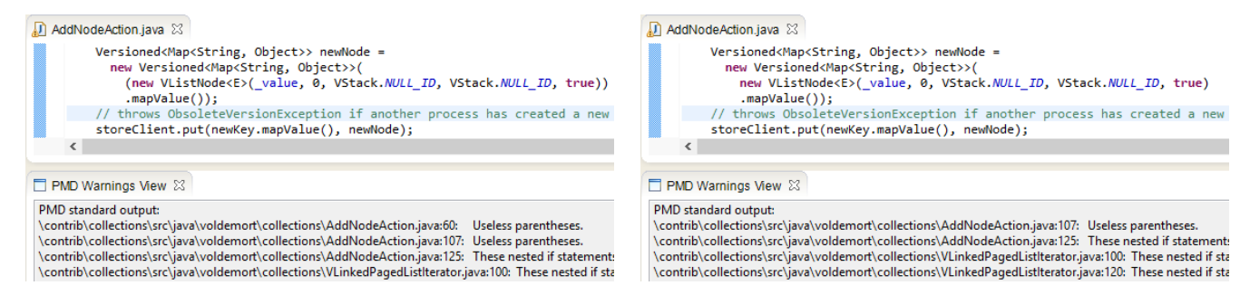
Figure 7: Continuous PMD running on Voldemort. Both images show the top four warnings. The left screenshot shows the original Voldemort implementation; its second PMD warning suggests that the parentheses around new are unnecessary. The developer removes these parentheses (right screenshot) and the second warning disappears, without the developer saving the file or invoking PMD.

be significant and required an extension to the project's architecture and writing more than 100 LoC. The case study lasted for 3 days and resulted in a successful removal of the bug.